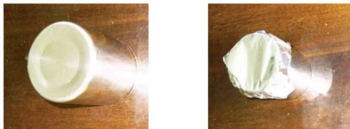
Fig. 2. Detector protection cap with- and without aluminum target foil.

I N principle, mono-isotopic mercury could be prepared by the same process used to enrich uranium. However, due to the military application of enriched uranium usage of such technology is closely monitored and thus not feasible without detection. Separation of isotopes by means of a magnetic field is an alternative, especially as only mg-quantities are needed anyway. Hereby, the same effects are used as in mass-spectroscopic measurement, and indeed it is possible and even easy to prepare mg samples of selected Hg-isotopes in the conventional mass spectrometer available in our laboratory anyway. The only modification required is the shielding of the detector with a target. The selected mercury isotopes will be implanted into the target and can be separated by standard chemical processes later. We managed to augment the build-in detector protection cap with an aluminum foil (Fig. 2). This foil can be changed via the sample door, thus not breaking the vacuum and allowing long up-times. The foil is irradiated with Hg after selecting an atomic mass of 203.97 and NOT removing the detector protection cap (See [2] for operator instructions). Afterwards, the foil is removed and dissolved. Run-times are long though, and over-night use is recommended. This also avoids exposure of the process to uninformed personnel.